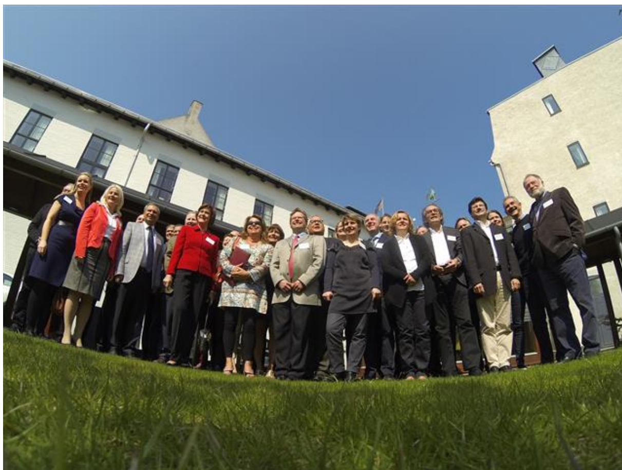
ANSS meeting in Copenhagen 2013